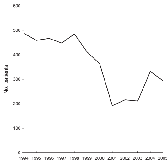
Figure 1. Number of injured patients per year seeking care for rabies postexposure prophylaxis, Marseille Centre, Marseille, France, 1994–2005.

Dogs accounted for 81.2% of all injuries. By contrast, a recent study on pet demographics in France indicated that dog and cat populations are nearly similar at 8.51 million and 9.94 million, respectively (12). This finding suggests that dogs, more often than cats, are responsible for severe injuries that lead persons to seek care for rabies PEP. The mean annual incidence of animal-related injuries was lower in rural than in urban communities (online Technical Appendix, available from www.cdc.gov/EID/