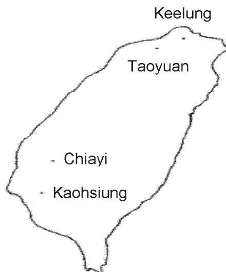
Figure 1. Geographic position of the four hospitals in Taiwan where Salmonella enterica Choleraesuis isolates were collected and surveyed for their susceptibility to ciprofloxacin, 2000–2003.

The annual isolate number of S. Choleraesuis among the four Chang Gung Memorial Hospitals and the resistance to ciprofloxacin from 2000 to 2003 are summarized in Figure 2. An apparent growing trend of resistance was observed. The overall resistance rate of the isolates collected from the four hospitals increased from 32.3% in 2000 to 56.5% in 2001, 61.8% in 2002, and 71.8% in 2003 ( p < 0.00001 by chi-square test). Ciprofloxacin resistance rate was generally lower in 2000; however, such resistance increased to >50% in Keelung, Taoyuan, and the newly opened Chiayi Chang Gung Memorial Hospitals in 2001 to 2002. The resistance rate remained constantly high in 2003. The highest rate was found in clinical isolates from