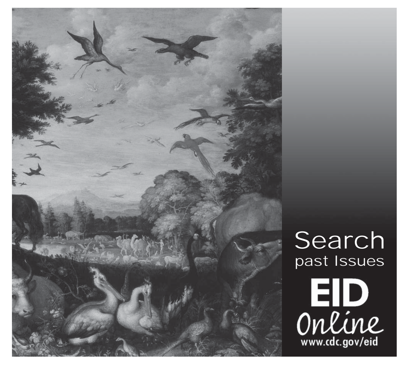
Emerging Infectious Diseases • www.cdc.gov/eid • Vol. 14, No. 1, January 2008