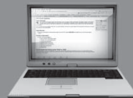
Table of contents Podcasts Ahead of Print CME Specialized topics