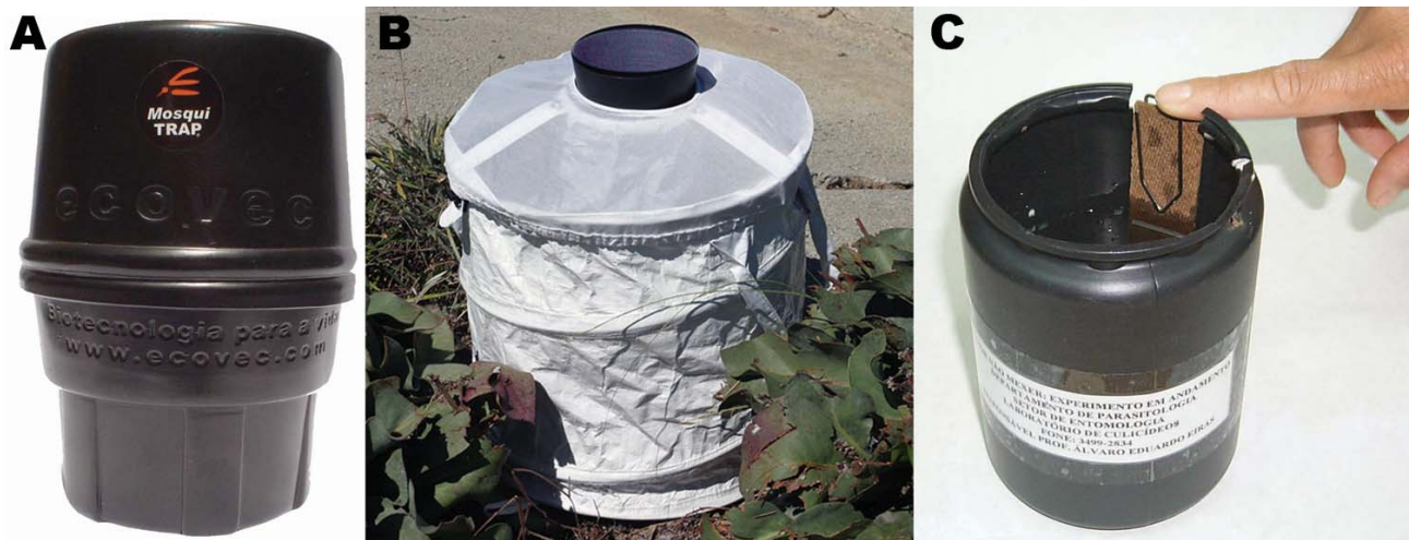
Figure 1. MosquiTRAP version 2.0 (Ecovec Ltd., Belo Horizonte, Brazil) (A), BG-Sentinel trap (Biogents, Regensburg, Germany) (B), and an ovitrap (C) used for obtaining mosquitoes in the northwestern borough of Belo Horizonte, Minas Gerais, Brazil.

pe, AZ, USA) with 1,000 bootstrap replicates. These sequences have been deposited in GenBank (accession nos. GQ330909–11 and GU588695–8).