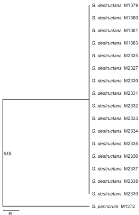
Figure 1. Consensus maximum-parsimony tree derived from analyzing 8 concatenated gene fragments including a total of 4,470 aligned nucleotides by using PAUP* 4.0 (8). The number 545 on the branch indicates the total number of variable nucleotide positions (out of the 4,470 nt) separating Geomyces pannorum M1372 from the clonal genotype of G. destructans identified here. Fifty of the 545 variable sites correspond to insertions and deletions. Scale bar indicates number of nucleotide substitutions per site.

geographic distributions similar to that in our study have shown major genetic variation among strains (12,13). It is also possible that humans and/or animals contributed to the rapid clonal dispersal. In such a scenario, the diseased or asymptomatic bats might act as carriers of the fungus by their migration into new hibernation sites where new animals get infected and the dissemination cycle continues (4). Similarly, the likely roles played by humans and/or other animals in the transfer of the fungal propagules from an affected site to a clean one cannot be ruled out from our data.