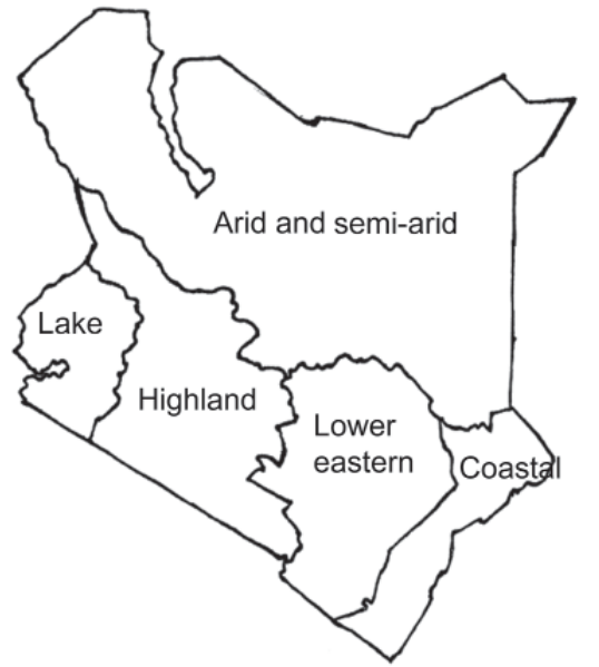
Figure 1. Geographic/climatic regions as defined in a study of the genetic relatedness of O1 Vibrio cholerae isolates, Kenya, January 2009–May 2010.

information was obtained for 10,497 of the case-patients, of whom 246 (2.3%) died and 173 (1.65%) had laboratory-confirmed cholera. Case-patients who met the clinical case definition were reported from 52 (35%) of the country's 149 districts and from all 5 geographic regions (Table 1). The age range for case-patients was 1–76 years (overall mean 23 years, SD \pm 18 years). The attack rate ranged from 0.02% in the lake and highland regions to 10-fold higher (0.2%) in the arid and semi-arid region. Case fatality rates ranged from 0.7% in the coastal region to 4.0% in the arid and semi-arid region (Table 1).