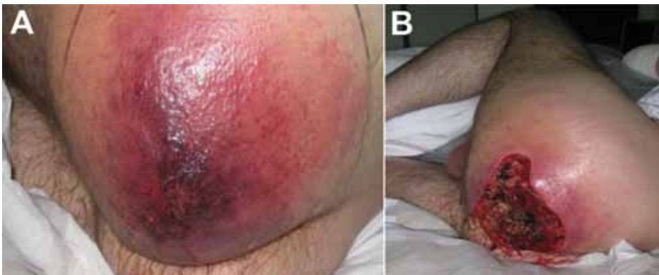
Figure 1. Manifestation of heroin-associated anthrax in patient 2, who injected heroin under the skin of his left buttock 1 week before seeking treatment. Panel A demonstrates severe edema with poorly demarcated erythema. He had debridement within hours of arrival. Panel B demonstrates the extent of debridement required to reach healthy tissue and to reduce the toxin burden; there was copious drainage of fluid and pus as well as bleeding to the area. The tissue between affected and unaffected areas was poorly demarcated.

Information was disseminated through the press and directly to at risk groups to ensure heightened public awareness; this led several PWIDs to present to the trust concerned regarding possible infection however they proved serologically negative. Community testing of PWIDs may be an important initiative to determine the seroprevalence of anthrax, identify subclinical cases and guide further research into anthrax and immunity.