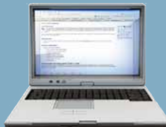
Table of contents Podcasts Ahead of Print CME Specialized topics

Sign up to receive emailed announcements when new podcasts or articles on topics you select are posted on our website.