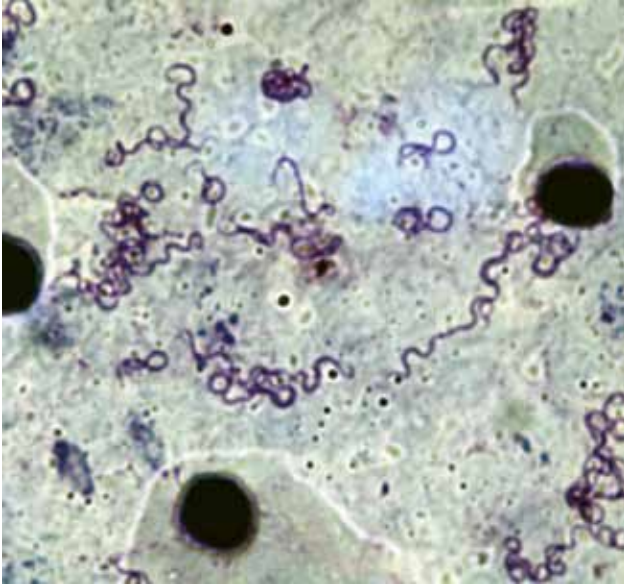
Figure 2. Thick smear of mouse blood showing Borrelia crocidurae isolate 02–03. Giemsa stain; original magnification x900.

collected during the dry (16.9%, 40/237) than the rainy season (6.9%, 30/432); p < 0.0001 (Figure 1).