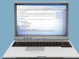
Table of contents Podcasts Ahead of Print CME Specialized topics

Sign up to receive emailed announcements when new podcasts or articles on topics you select are posted on our website.