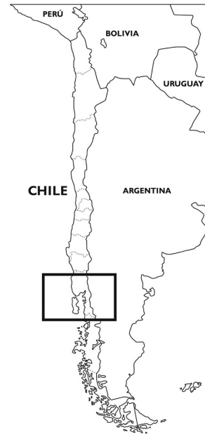
Figure 1. The 13 communes in the provinces of Llanquihue and Palena, southern Chile. (Two communes share the name of the province to which they belong.) Asterisk indicates Andean communes. Inset: South America, with study area in box.

arterial oxygen tension/inspiratory oxygen fraction (PAFI) index, steroid administration, mechanical ventilation (MV) (specifying timing of connection), and circulatory shock. Shock was defined as systolic blood pressure <90 mm Hg that did not improve with fluid administration or that required the use of vasoactive drugs and abnormalities in tissue perfusion manifested by alteration of consciousness, oliguria, and lactate acidosis (5). One of the authors (R.R.) analyzed chest radiographs and classified the infiltrates as alveolar, interstitial, or mixed pattern and unilateral or bilateral; number of compromised quadrants and presence of pleural effusion were recorded. Results of laboratory tests performed on admission and during illness were also recorded. Each case was classified into 1 of 3 groups: grade I (mild disease) when patients had only