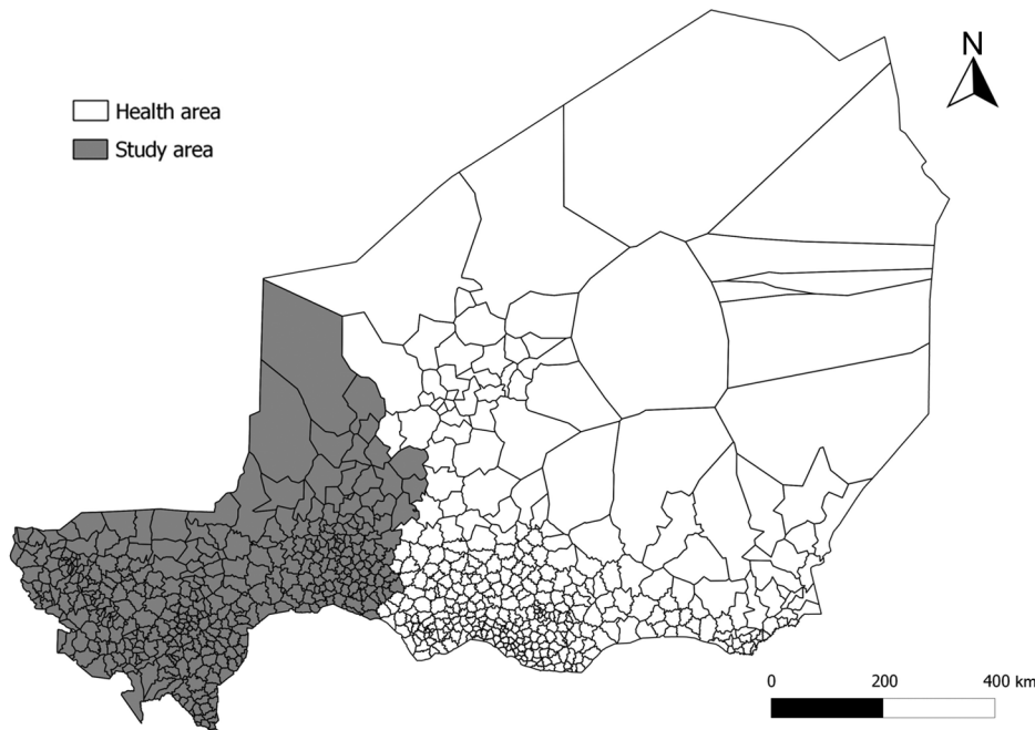
Figure 1. Location of the study area, Niger. This area comprises the 379 health areas in 3 regions (Tahoua, Tillabery, and Dosso).

Using these data, we prepared a database simulating the situation after NmA elimination by excluding all health area years with at least 1 NmA case or without any laboratory information. A health area year corresponded to a health area that appears in the annual reporting file, so that in our analysis health area years represented all the health areas that appear in annual reporting files during the study