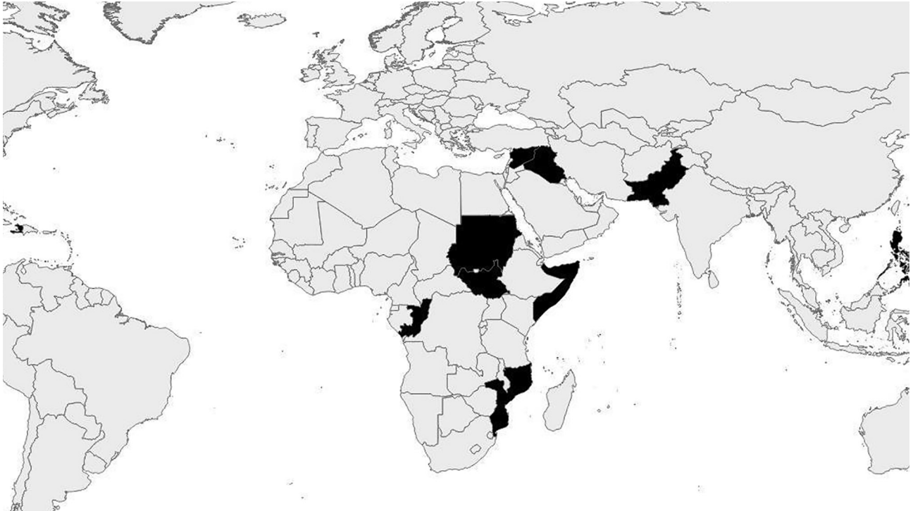
Figure 1. Countries (shown in black) where the US Centers for Disease Control and Prevention's Emergency Response and Recovery Branch (Division of Global Health Protection, Center for Global Health), with the World Health Organization's Health Emergencies Program, has provided support for implementation or evaluation of early warning surveillance systems in response to humanitarian emergencies.

to reduce the burden on clinic staff and to allow for data-quality checks and 2) the need to use proportional morbidity to analyze disease trends because of the lack of accurate denominator data.