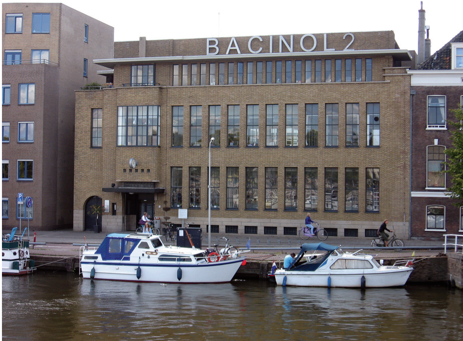
Figure. Bacinol 2, building named in honor of the site of efforts in the Netherlands to produce penicillin during World War II and the drug produced by the Netherlands Yeast and Spirit Factory in Delft. Bacinol was a code name for penicillin.

against some penicillin from England, proving it to be the same compound. NG&SF began marketing the penicillin they produced in January 1946. Although the original building where Bacinol was produced was demolished, NG&SF named a new building in honor of their WWII efforts (Figure).