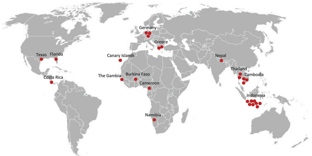
Figure 1. Countries and US states in which 27 of 28 patients acquired typhus group rickettsiosis diagnosed in Germany, 2010–2017. For 1 of the 28 patients, no information was available. Most infections were acquired in Southeast Asia, although 3 autochthonous cases were found in Germany. Each dot symbolizes 1 patient.

titer differences were noted between serum tested for R. typhi and R. prowazekii .