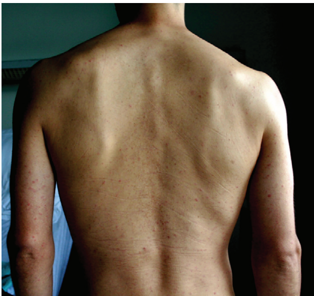
Figure 2. Typical exanthema in a typhus patient after travel to Thailand. The rash is maculopapular and nonpruritic.

In our study, laboratory data, which could not be retrieved in detail for all patients, often showed elevated levels of C-reactive protein, LDH, and liver enzymes,