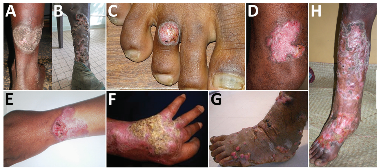
Figure 2. Clinical forms of chromoblastomycosis caused by Fonsecaea sp., Madagascar. A) Plaque; B) mixed: tumorous and cicatricial; C) nodular; D) raised plaque; E) plaque; F) cicatricial; G) tumorous caused by Cladophialophora carrionii ; H) mixed: cicatricial and modified by previous therapy.

to Fonsecaea strains collected previously by Institut Pasteur in Madagascar and identified as F. pedrosoi (23). The Fonsecaea strains were isolated from patients who originated from the humid tropical zones of eastern Madagascar, whereas C. carrionii was restricted to the southern and eastern regions of this country (Figure 1, panel C).