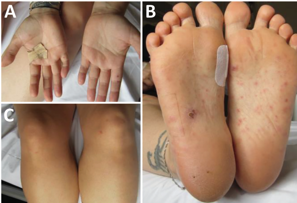
Figure 1. Rat bite fever lesions on 32-year-old female patient, Germany, 2022. At the time of patient's readmission, reddish papules appeared on the palms of the hands (A), soles of the feet (B), and legs (C).

appeared immediately after discharge. A few days later, she went to the dermatology department with a fever and red, nonitching papules on hands, legs, and feet (Figure 1). We examined the papules, finding them comparable to Janeway lesions, and took a biopsy from the right hand. We collected a second blood culture that was positive within 18 hours with growth of a gram-negative bacilli. We identified S. moniliformis bacteria by using matrix-assisted laser desorption/ionization time-of-flight mass spectrometry.