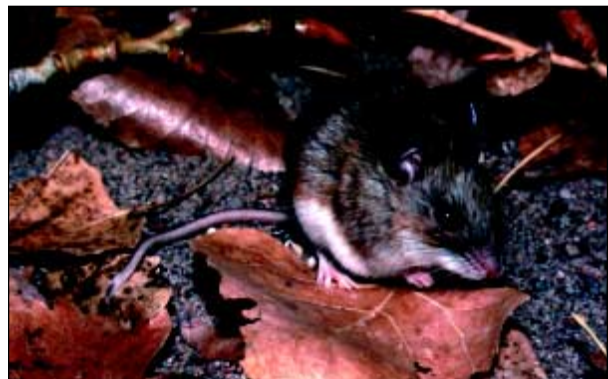
Figure 1. White-footed mouse ( Peromyscus leucopus ).

Investigations of HPS cases in the United States have resulted not only in studies of the deer mouse and SNV but also in the identification of three additional host-virus relationships that maintain hantaviruses responsible for human disease (New York virus carried by the white-footed mouse, Peromyscus leucopus [Figure 1] [15]; Black Creek Canal virus carried by the cotton rat, Sigmodon hispidus [16]; and Bayou virus carried by the rice rat, Oryzomys palustris [17]). Most HPS cases in the United States have been caused by SNV.