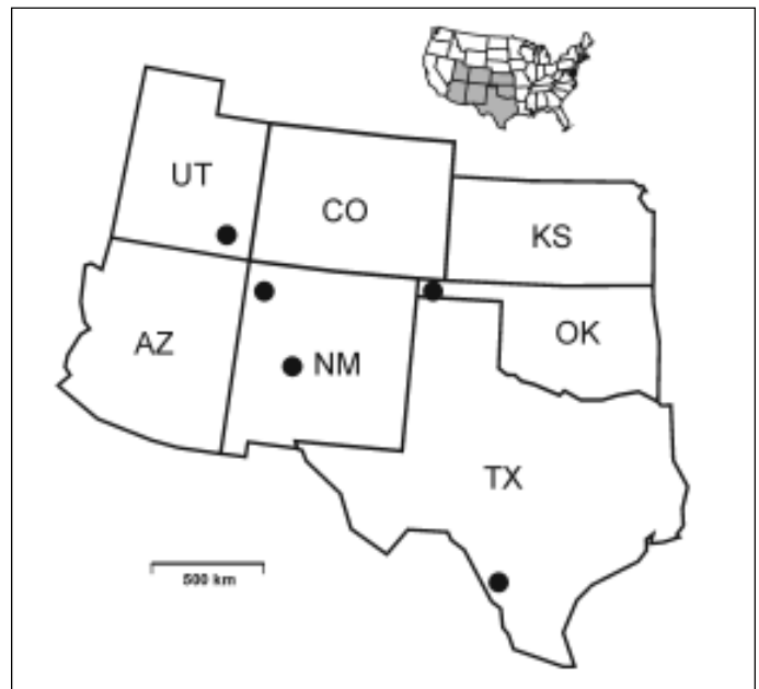
Figure 1. Locations of 14 arenavirus-positive Neotoma rodent collections. San Juan County, southeastern Utah = N. cinerea and N. mexicana (one virus-positive animal each species); Cimarron County, western Oklahoma = N. albigula (2); McKinley County, northwestern New Mexico = N. albigula (2); Socorro County, central New Mexico = N. mexicana (3); Dimmit and La Salle counties (Chaparral Wildlife Management Area), southern Texas = N. micropus (5). The map inset shows the location of study area.

The virus-positive animals included two N. albigula from McKinley County, northwestern New Mexico; two N. albigula from Cimarron County, western Oklahoma; three N. mexicana from Socorro County, central New Mexico; five N. micropus from the Chaparral Wildlife Management Area (Dimmit and La Salle counties), southern Texas; and one N. mexicana and one N. cinerea from San Juan County, southeastern Utah (Table 2, Figure 1). The virus-positive animals from McKinley County were two (50%) of four woodrats (all N. albigula ) collected on July 15, 1993, from Whitewater Arroyo. The positive N. albigula from Cimarron County were two (22.2%) of nine woodrats (seven N. albigula and two N. mexicana ) collected on October 12, 1985, from a site near Kenton. The positive N. mexicana from Socorro County were three (42.9%) of seven woodrats (all N. mexicana ) collected on September