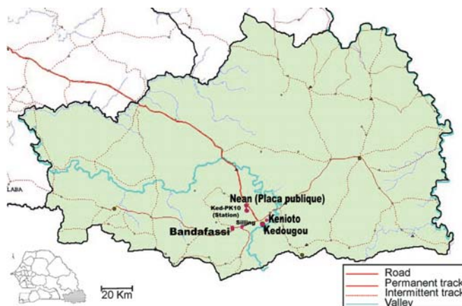
Figure 1. Map of the Kedougou area, Senegal, showing geographic position of villages and forest gallery where dengue virus serotype 2 vectors were collected.

After initial results of virus isolation from mosquitoes showed evidence of DENV-2 circulation, serologic investigations on monkeys were undertaken January 31–February 6, 2000. Blood samples were collected from each wild monkey captured with flexible nets in the forest gallery. Briefly, animals were immobilized with ketamine HCl (Merial, Lyon, France), 10–15 mg/kg of body weight, injected intramuscularly. Blood